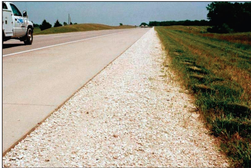
Figure 1. Daylighted permeable base on US 50 in Kansas (Gisi, Brennan, and Luedders 2004).

Figures 1 and 2 show examples of the daylighted permeable base layers. The permeable layer used for the South Rochford Road crossing would be designed to convey both surface water and shallow groundwater. A culvert could also be incorporated to handle some of the baseflow and to provide a secondary route for snowmelt runoff if the base layer were to freeze. The permeable base would still serve its purpose in connecting the groundwater flow across the roadway and providing a media for spreading out some of the flow at the crossing.