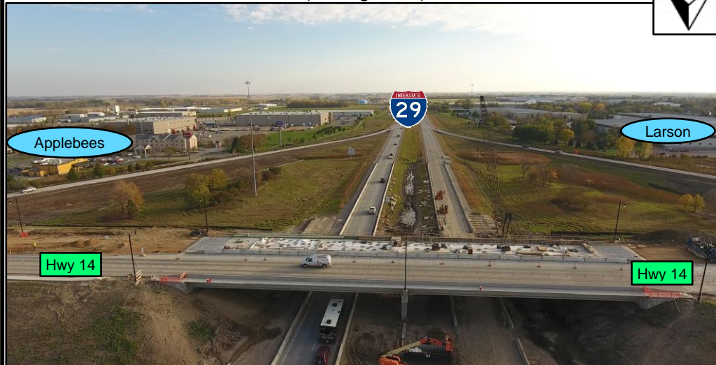
Project Photo: Bridge work @ I-29 bridge. (looking south)