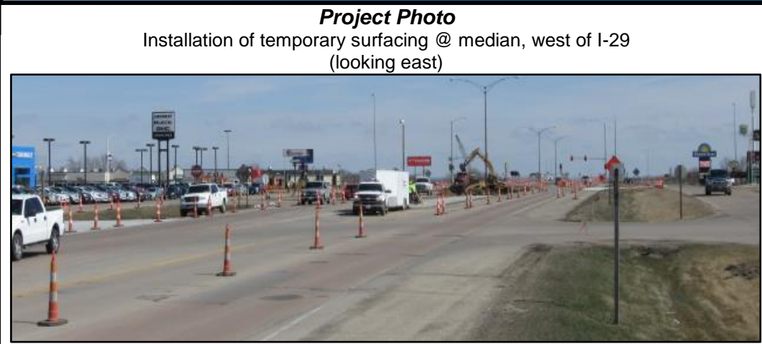
Project Photo Installation of temporary surfacing @ median, west of I-29 (looking east)