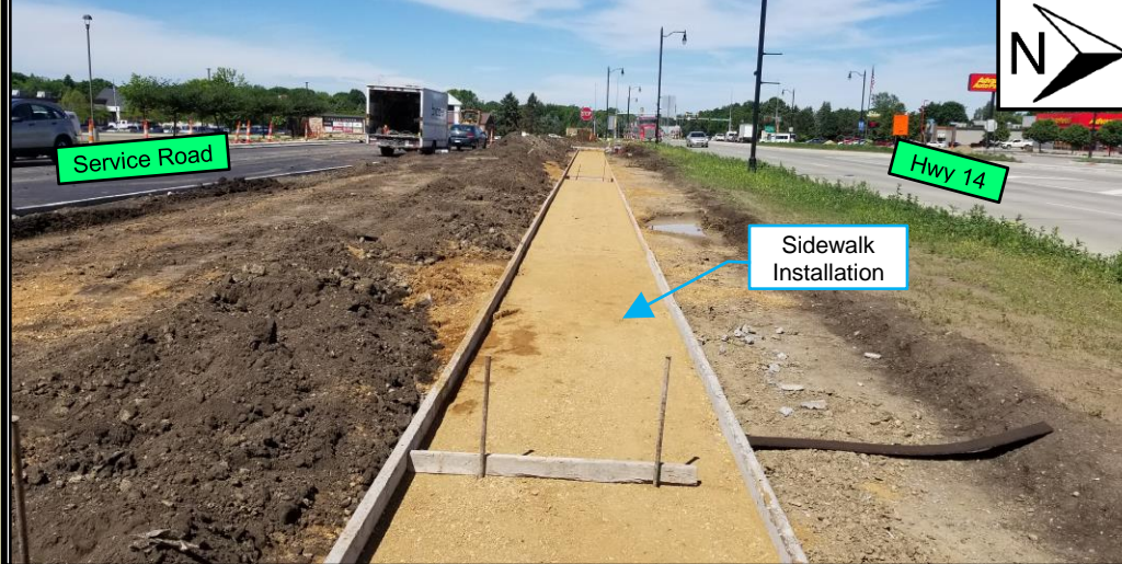
Project Photo: Sidewalk installation @ south side of Hwy 14 (looking west)

Work completed this spring: • Service Road along north side of 6 th Street @ west end of project. • Texture finish / barrier work for the Hwy 14 Bridge @ I-29. • Curb island on the north side of the 34th Avenue intersection. • Ramp detours along I-29 have been removed. • Regrading and seeding of the median ditch along I-29. • Installation of Berm Slope Protection beneath the Hwy 14 Bridge @ I-29.