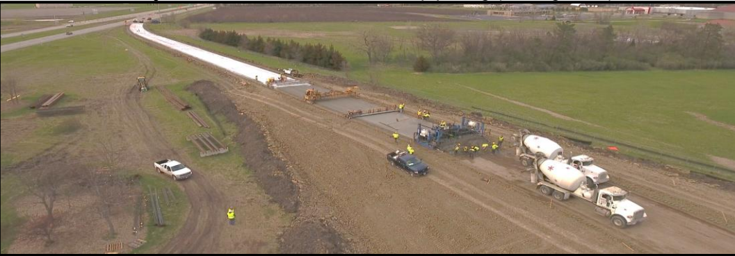
Project Photo: Northeast I-29 ramp paving (looking north)