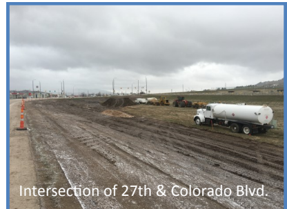
Intersection of 27th & Colorado Blvd.