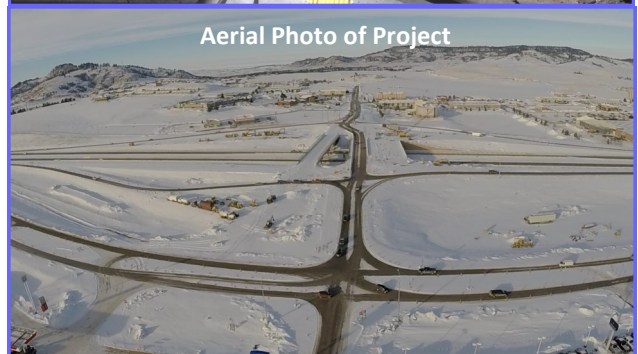
Aerial Photo of Project