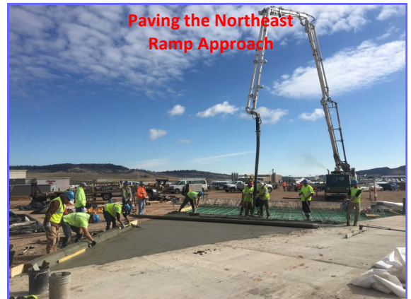
Paving the Northeast Ramp Approach