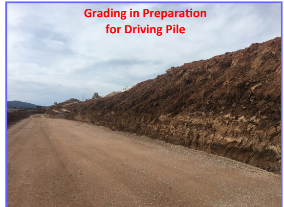
Grading in Preparation for Driving Pile