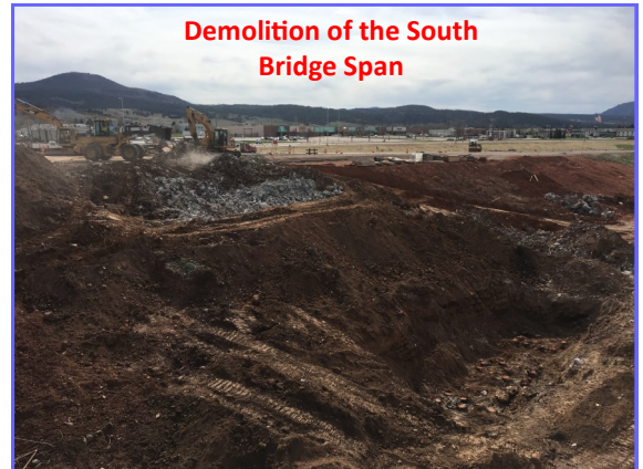
Demolition of the South Bridge Span