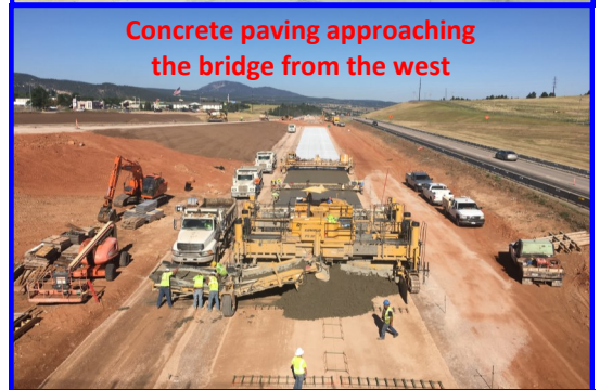
Concrete paving approaching the bridge from the west