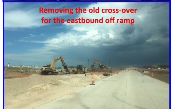
Removing the old cross-over for the eastbound off ramp