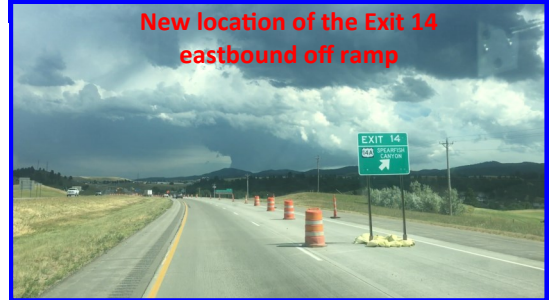
New location of the Exit 14 eastbound off ramp