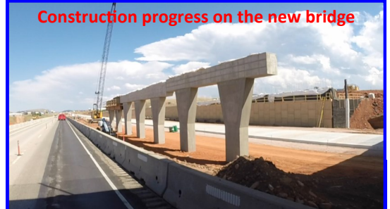
Construction progress on the new bridge